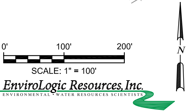
FIGURE 6-55 POTENTIOMETRIC SURFACE AOC 2 - JULY 19, 2004 Remedial Investigation/Feasibility Study Astoria Area-Wide Petroleum Site Astoria, Oregon